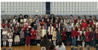
1st Grade Winter Concert

Norwell Public Schools is now accepting registrations for community preschoolers for the 2024-2025 Preschool Lottery. Any preschooler who will be 3 or 4 before September 1, 2024 is eligible to enter the lottery. Visit our website HERE to learn more.