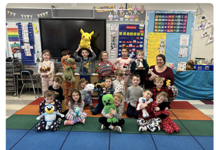
PJ/Stuffy Day in K